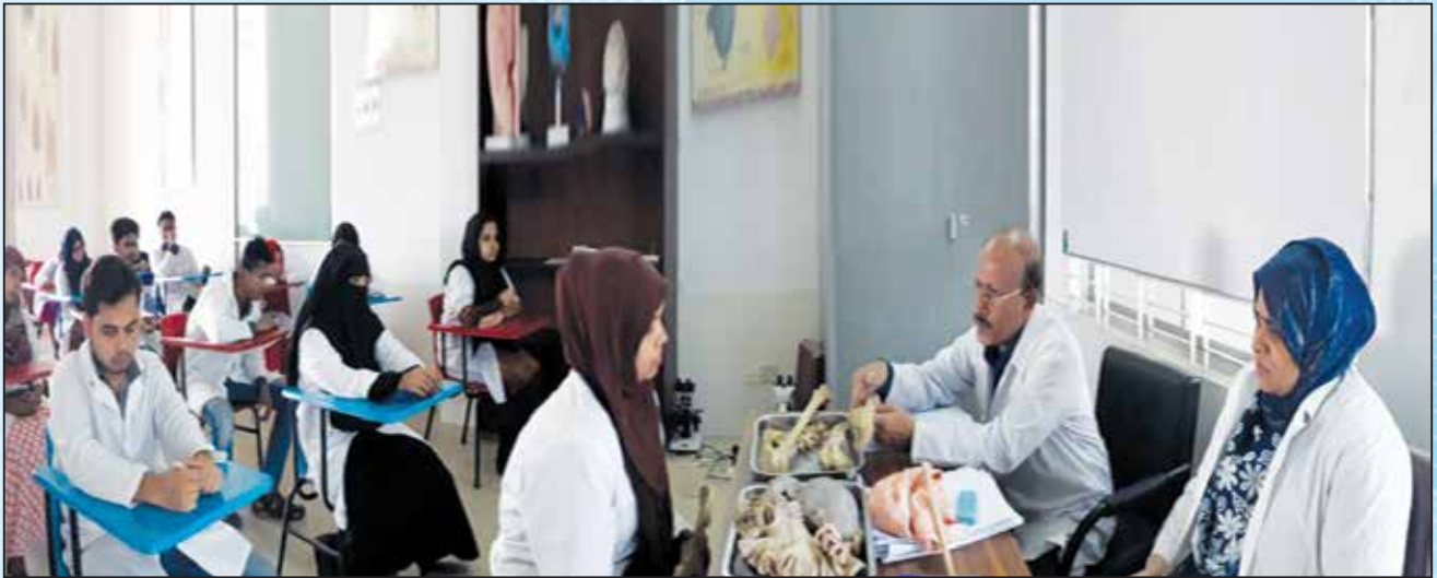
Anatomy Lecture Class