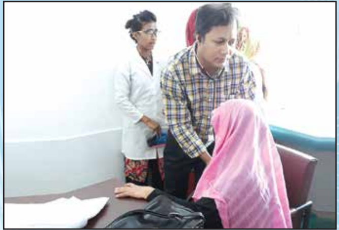
Medicine Lecture & Clinical Class with Respected Teachers