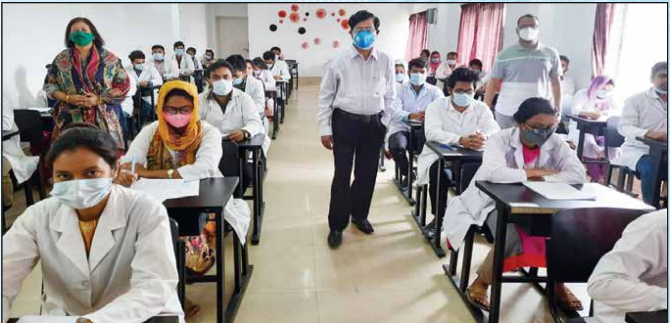
Students attending their assesment on Paediatrics