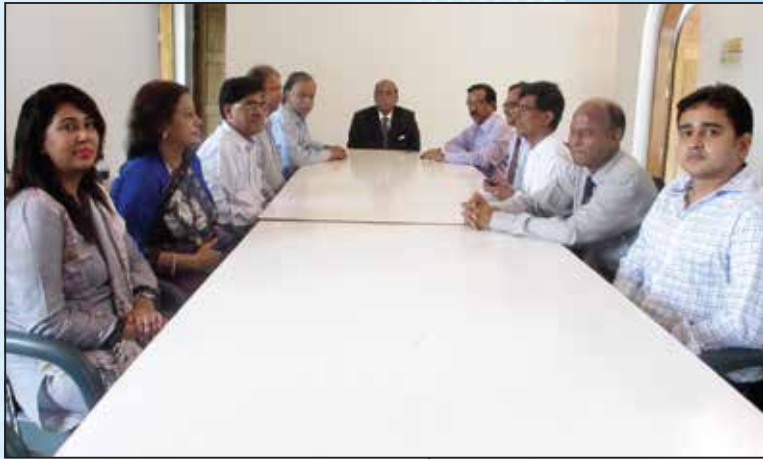
First Meeting of Dhaka University Inspection team with Governing Body