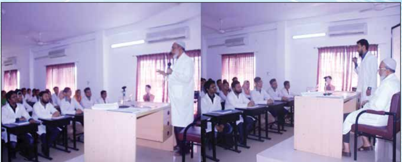
Lecture at Biochemistry Department