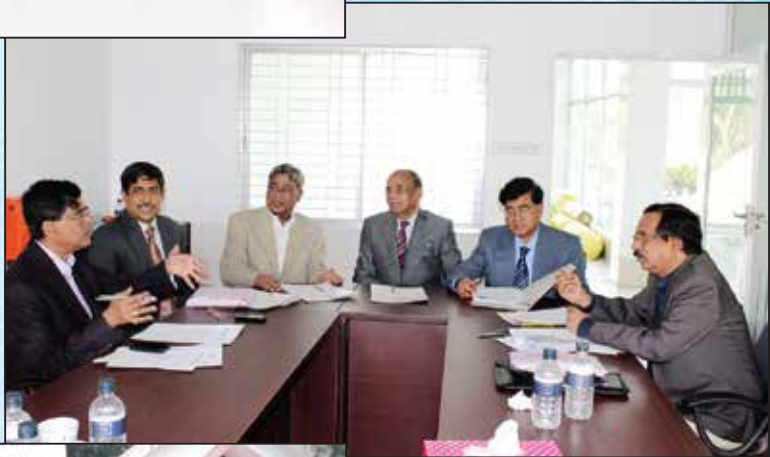
First meeting between DU inspection team and governing body