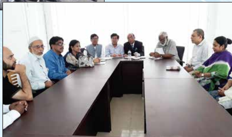
Academic Council Meeting at BBMC