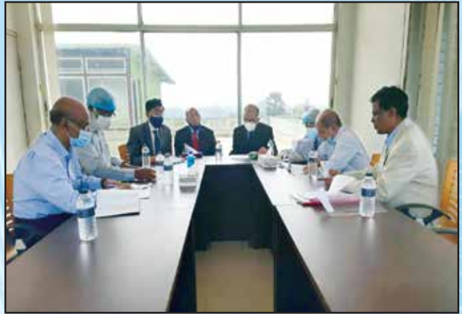
Bikrampur Bhuiyan Medical College was visited by the inspection team of Bangladesh Medical & Dental Council and Ministry of Health.