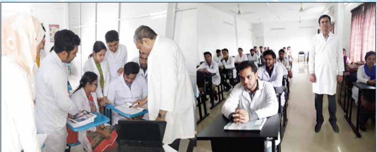
Pharmacology & Pathology Department in full swing