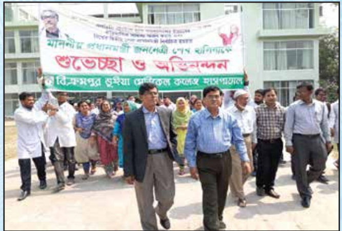
Performing the national anthem on the eve of the inauguration ceremony and congratulations to Prime Minister Sheikh Hasina as the second best Prime Minister in the world.