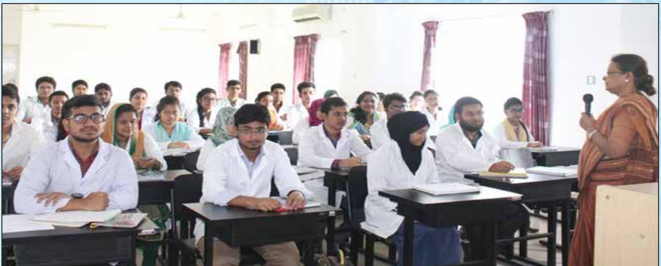
Physiology Lecture Class