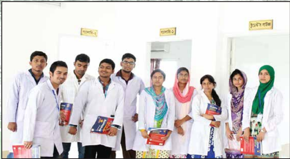
First Batch- very competent and flawless in their endeavour.