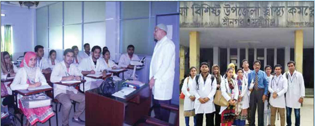
Forensic Medicine Lecture Class