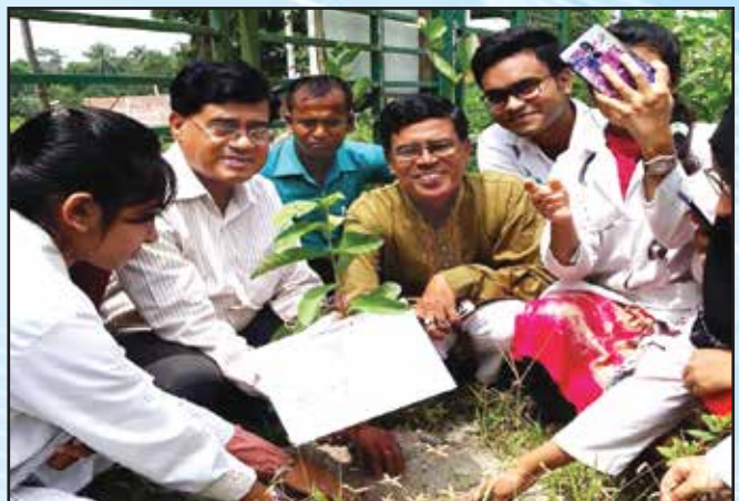
Free medical camp and tree planting program on the historic 10th January Bangabandhu's Homecoming Day.