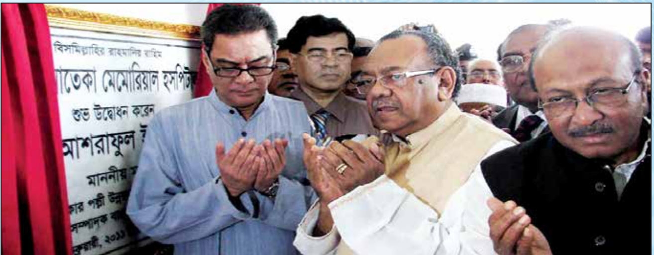
Opening ceremony in presence of Syed Ashrafur Islam Ex-Minister of Public Administration of the Bangladesh Government Ex-Health Minister & Ex-Health Advisor of Honourable Prime Minister