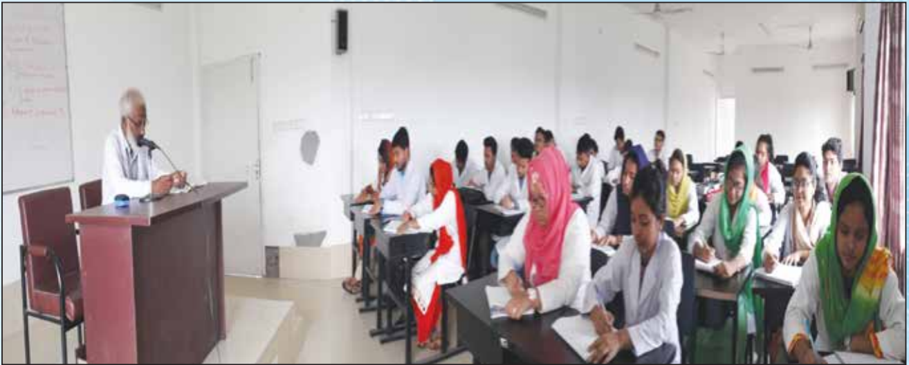
Lecture at Microbiology Department