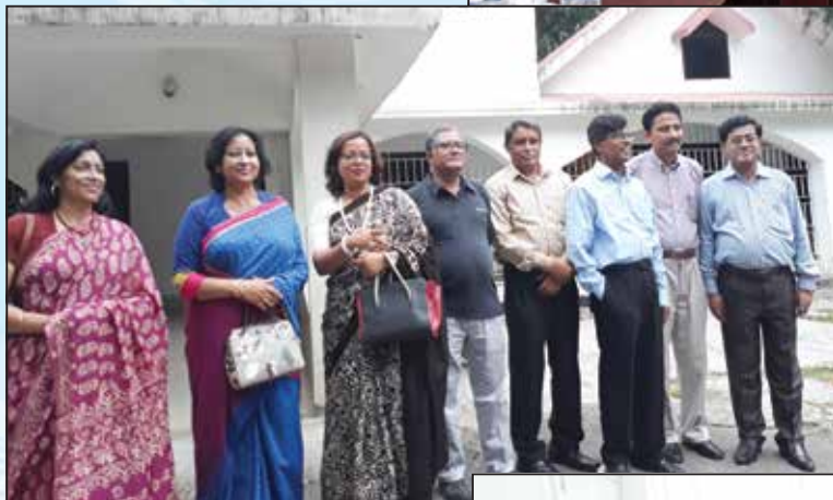
Inspection team from Dhaka University at BBMC